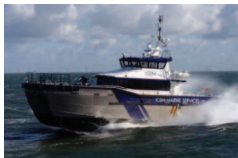
LAUNCHED MARCH 2015