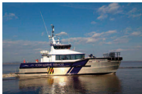
22M CREW TRANSFER VESSEL