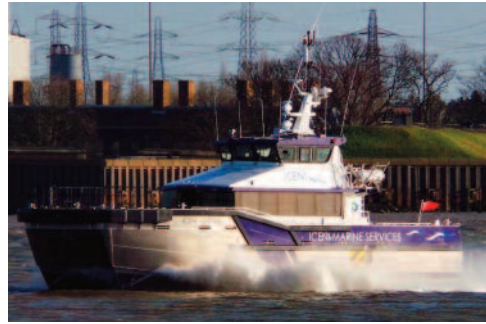
22M CREW TRANSFER VESSEL