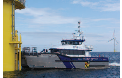
LAUNCHED JANUARY 2015