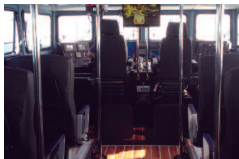
SATELLITE TV, DVD & WIRELESS 3G INTERNET