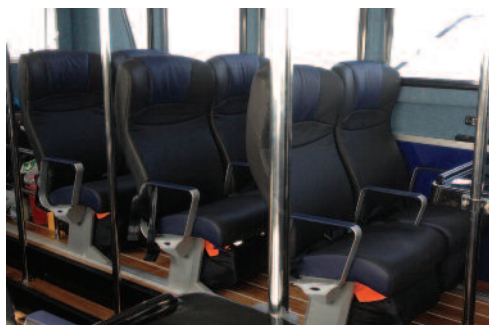
BEURTEAUX OCEAN CLUB LEATHER SEATS