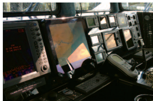
MODULAR WHEEL HOUSE