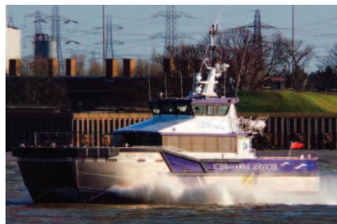
23M CREW TRANSFER VESSEL