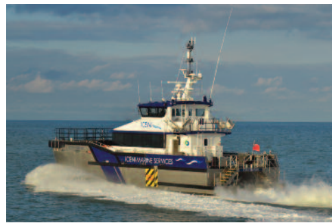
LAUNCHED JANUARY 2015