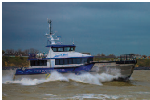
LAUNCHED SPRING 2017