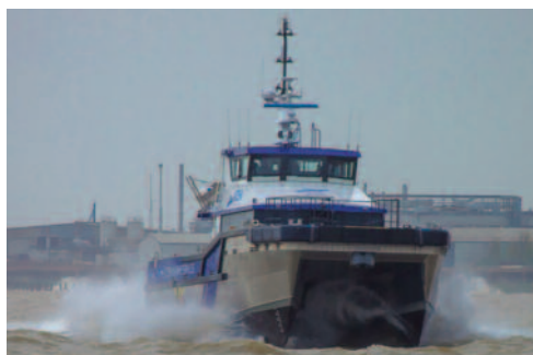
23M CREW TRANSFER VESSEL