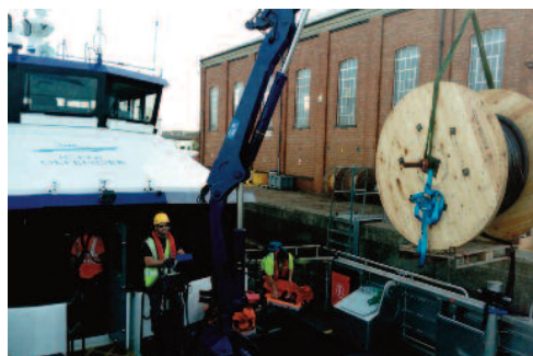
23M CREW TRANSFER VESSEL