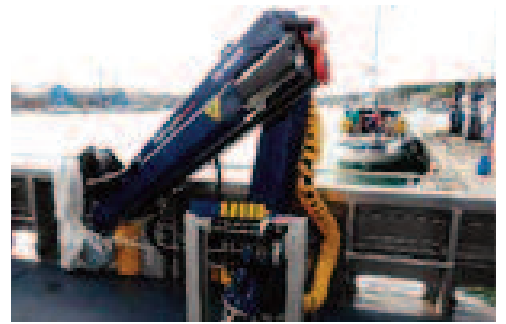
PALFINGER PK4501M DECK CRANE