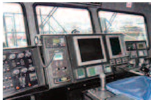
MODULAR WHEEL HOUSE