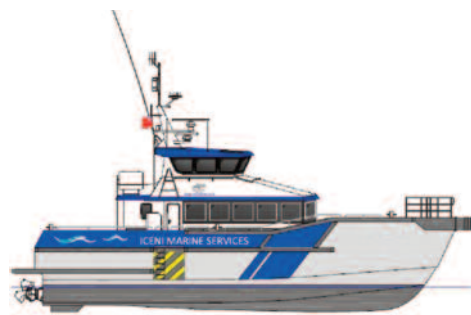
22M CREW TRANSFER VESSEL