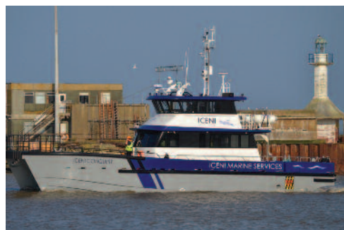
LAUNCHED MARCH 2015