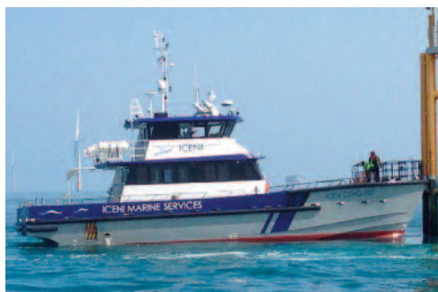
21M CREW TRANSFER VESSEL