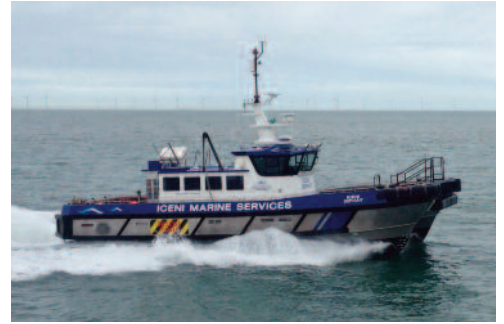
SPECIALIST WIND TURBINE BOW FENDER